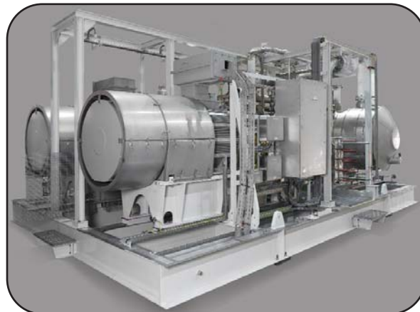
Gjøa Platform, North Sea

Built by K-Lund, Norway, featuring a NASH NAB 1500 two stage liquid ring compressor. Designed for a flow rate of 1500 m 3 /h and a discharge pressure of 6 to 9 bar absolute