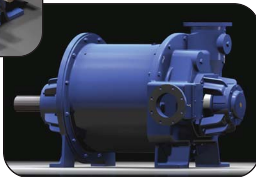
NASH HP-9, Vectra and NAB/NAM Compressors are tireless workhorses, ideal for your offshore applications