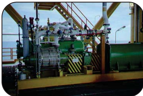
NASH 2BG Compressor used for vent gas compression on an offshore rig

Built by K-Lund, Norway, featuring a NASH NAB 1500 two stage liquid ring compressor. Designed for a flow rate of 1500 m 3 /h and a discharge pressure of 6 to 9 bar absolute