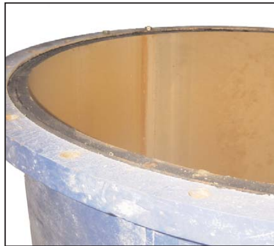
Polyisoprene lined casing - after use

NASH Div. of Gardner Denver 9 Trefoil Drive Trumbull, CT 06611 U.S.A. tel: 800 553 NASH + 203 459 3900 fax: + 203 459 3988 nash@gardnerdenver.com www.GDNash.com