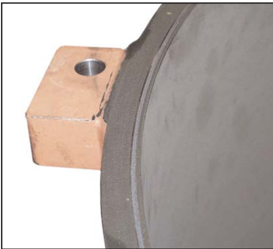
Polyisoprene lined casing - before use