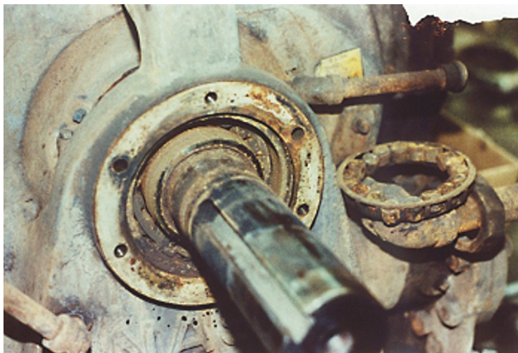
Typical Bearing Failure

A Nash service technician can help you remotely monitor your system and make recommendations prior to a visit.